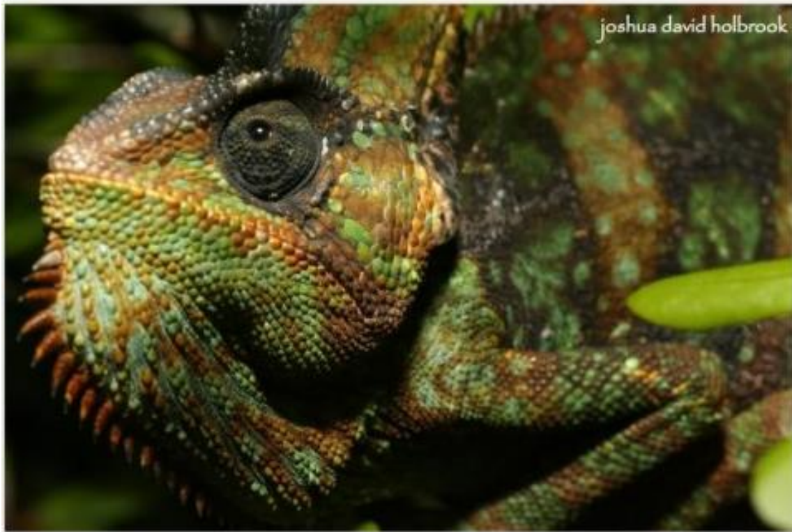
Veiled Chameleon ( Chamaeleo calyptratus )